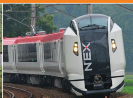
NARITA EXPRESS (N'EX)

Narita Airport - Tōkyō / Shinjuku / Shibuya / Ikebukuro Shinagawa / Yokohama / Ōfuna / Ōmiya / Takao